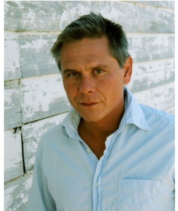
Walter Kirn, author of Up in the Air

6:00 - Keynote Talk: Walter Kirn, author of Up in the Air