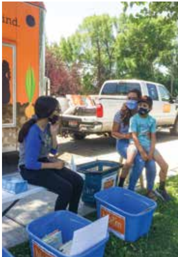
The Bloom Bookmobile, in partnership with The Hunger Coalition, provides free books and food to children and adults from Carey to Ketchum each summer.