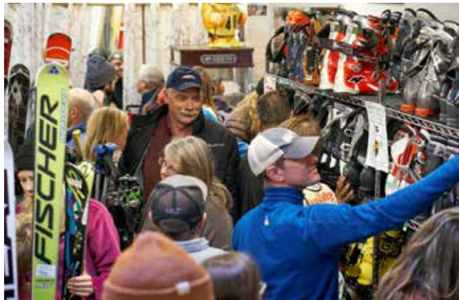
The Gold Mine Thrift and Consign Stores support the core work of the Library while re-using goods and contributing to local fun. Last year, 166,110 Gold Mine shoppers got great deals while supporting literacy and lifelong learning!