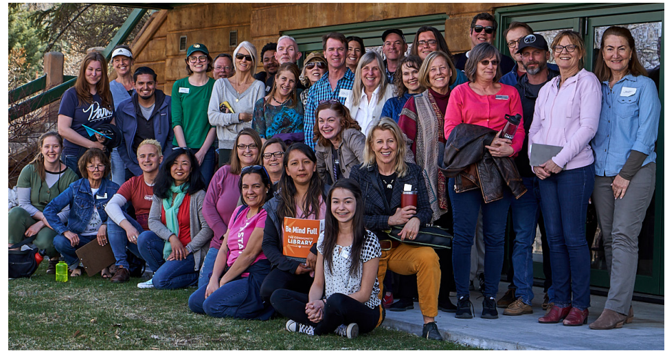
The Community Library and Gold Mine Staff.

The Community Library is a privately-funded, privately-governed, publicly-minded cultural institution. Unlike most public libraries, it receives no dedicated tax dollars. It depends on individual donations and revenue from the Gold Mine Stores.