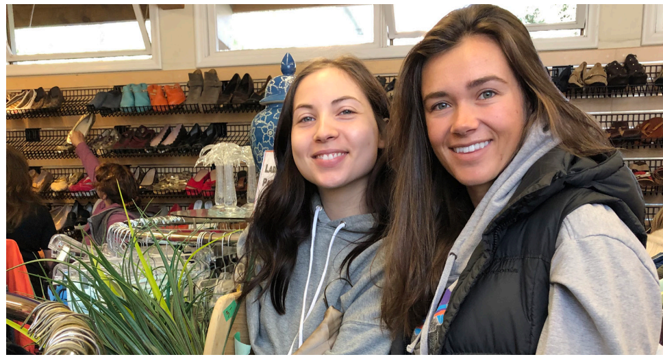
237,400 Gold Mine Thrift Store shoppers supported the Library by buying 250,525 recycled goods. 100% of net revenue goes to the Library!

The Community Library is a privately-funded, privately-governed, publicly-minded cultural institution. Unlike most public libraries, it receives no dedicated tax dollars. It depends on individual donations and revenue from the Gold Mine Stores.