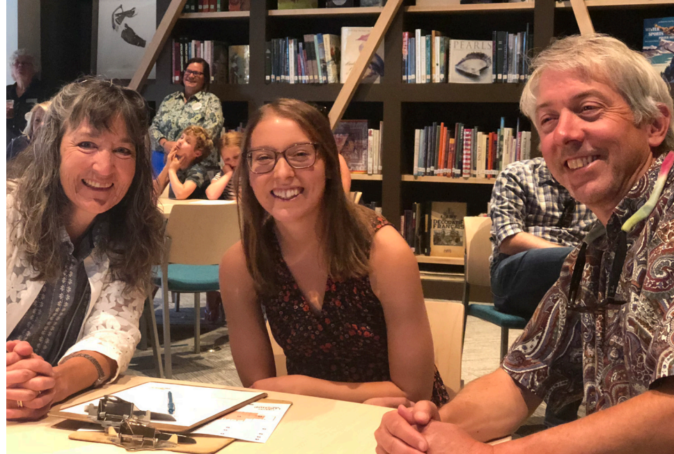
A family teamed together for literary trivia during LitHop 2018.