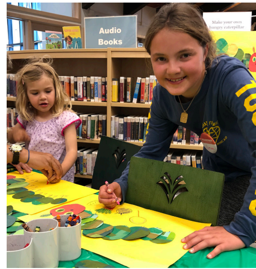
Kids celebrated The Very Hungry Caterpillar ’s 50th birthday in June.