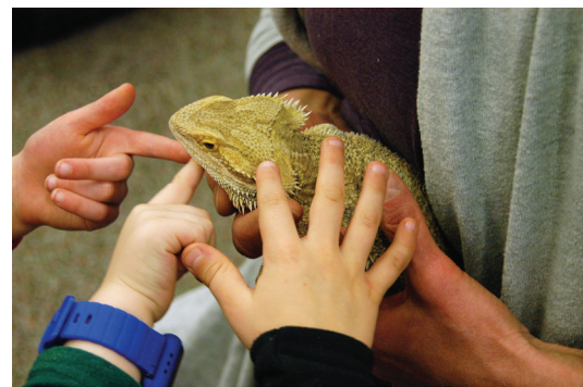
Kids learned about nature (and touched a bearded dragon) during Science Time!