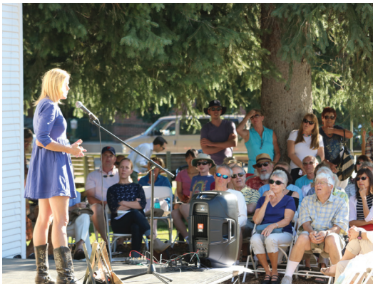
Mariel Hemingway shed light on local history at the museum during LitWalk.