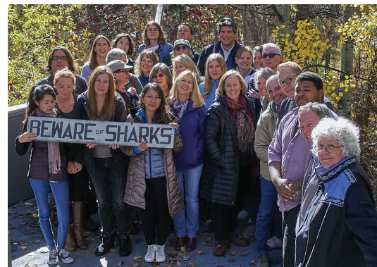
The Community Library Association staff helped 342,368 visitors find everything from books to bikes.