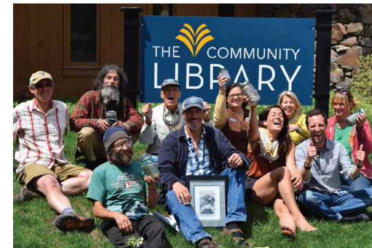
Wood River Seed Savers cataloged local seeds and celebrated local growing initiatives.