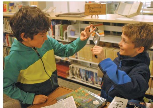
Fourth graders learned about their home turf by exploring the Center for Regional History.