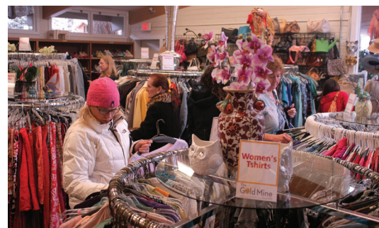
217,309 people dug for recycled treasures (supporting the Library) at the Gold Mine.