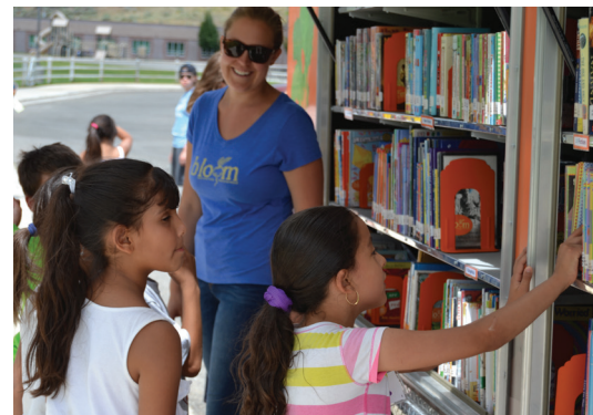
212 kids read more than 2,000 books from the Bloom Bookmobile.